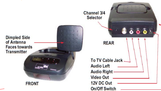
(B) Above photo Basic Receiver

Other factors that may cause signal interference include metal/concrete obstacles, water, other 2.4GHz wireless devices and microwave ovens operating in close proximity to the receiver unit.