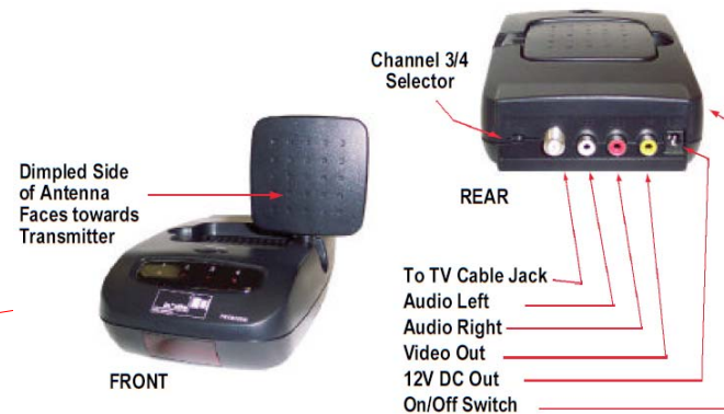
(B) Above photo Basic Receiver