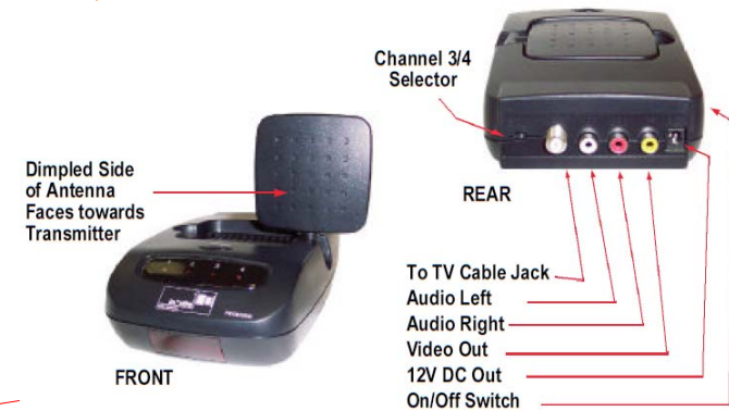
(B) Above photo Basic Receiver

Other factors that may cause signal interference include metal/concrete obstacles, water, other 2.4GHz wireless devices and microwave ovens operating in close proximity to the receiver unit.